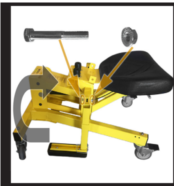
Step 5: Replace the arr