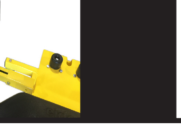
*Online Product Registration:

http://www.eidosergonomics.com/product-registration.html